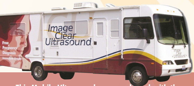
This Mobile Ultrasound was purchased with the assistance of a matching grant from Choose Life, Inc.

This specialty plate is now approved in more than 30 states and has raised over $25 Million dollars to support the positive choices of life, adoption and safe havens.